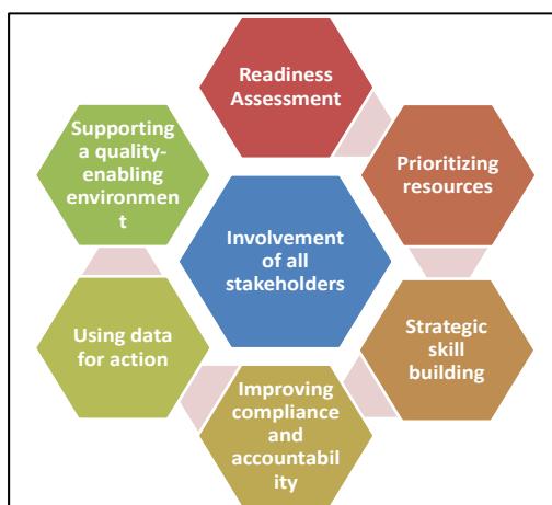
Implementation Approach of Jhpiego’s MNH Programs

Jhpiego is strongly committed to improving the quality of care in the field of maternal and newborn health (MNH). Focusing strategically on the intrapartum and immediate postpartum period—the periods of highest risk of morbidity and mortality for both mothers and babies—Jhpiego’s MNH programming aims to institutionalize high-impact, evidence-based practices at health facilities providing MNH care through two major approaches—the Safe Childbirth Checklist (SCC) 1 , and the clinical standards using Standards-Based Management and Recognition (SBM-R).