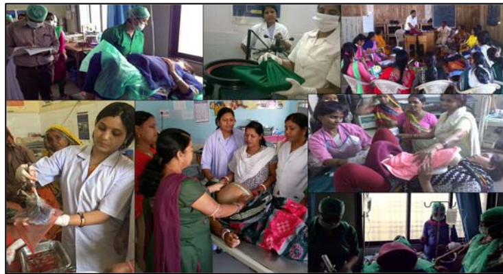
Skill Building under Dakshata

Till date, Jhpiego has conducted 35 ToTs, preparing more than 650 master trainers across these states. More than 480 district level trainings have been completed where close to 8200 participants (doctors and staff nurses) have been trained on the key evidence-based, life-saving practices under this initiative. More than 1600 facility-based Mentorship and Support Visits (MSVs) have been conducted across the saturated facilities have been conducted. These MSVs have been designed as structured hand-holding activities, wherein emergency obstetric drills on key maternal and neonatal complications are also conducted with the facility staff.