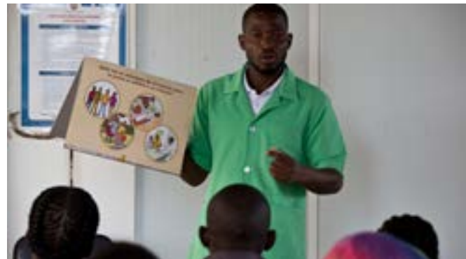
Young boys and men are counseled before being circumcised in a health center in Maputo, Mozambique.

With the generous support of the President's Emergency Plan for AIDS Relief, Jhpiego collaborates with ministries of health and defense force health systems to scale up VMMC as part of a comprehensive package of HIV prevention services. Central to Jhpiego's success is the ability to introduce and quickly scale up evidence-based innovations by fostering acceptance and demand; offering convenient, respectful, and high-quality services; and leveraging data management systems that assist key stakeholders with decision-making.